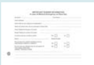
EMERGENCY DETAILS FORM