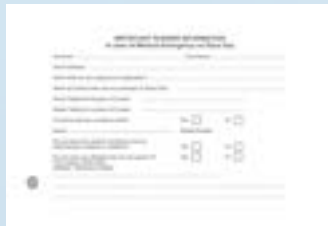
EMERGENCY DETAILS FORM